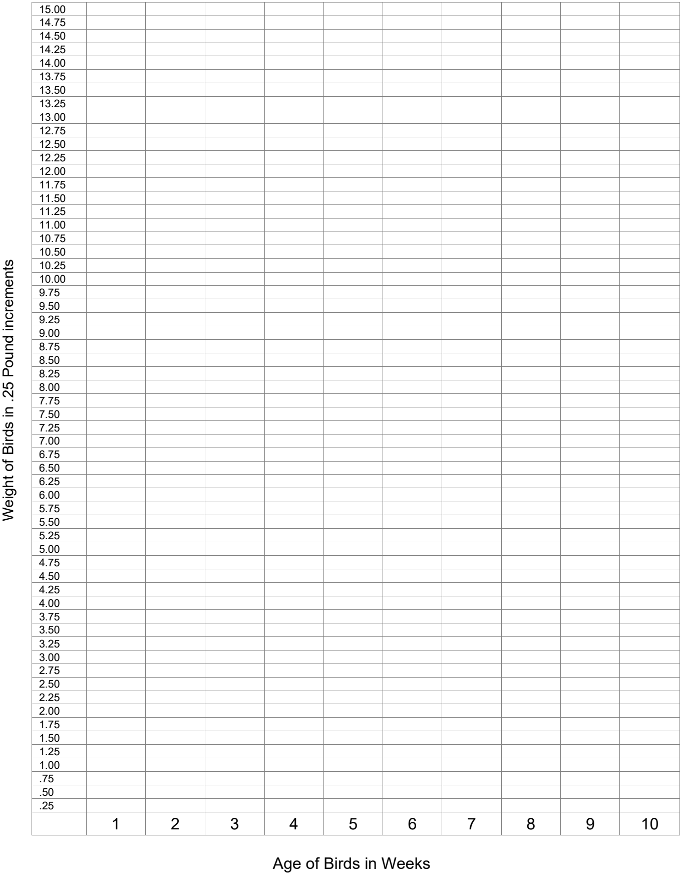
Growth Rate Graph for Chickens