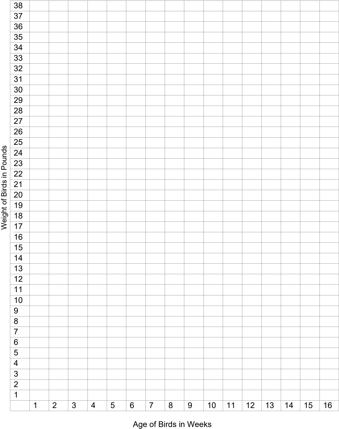
Growth Rate Graph for Turkeys, Geese & Ducks